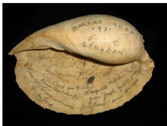
The Great Barrier Reef shell Esme Pulsford's signature is at the lower left