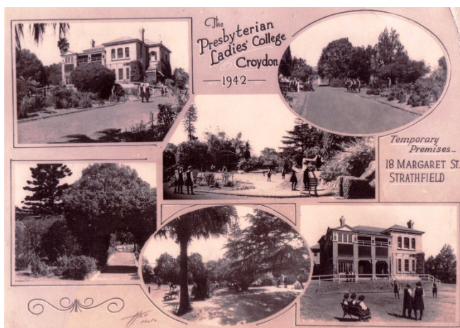
Temporary premises during World War II

Students and staff returned to Croydon at the beginning of 1946.