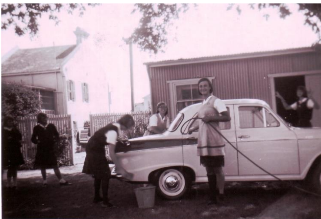
SCM Car Wash, 1965