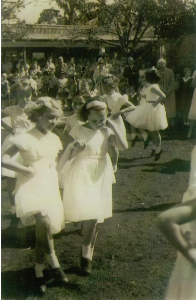
Maypole dancing, 1961

Other images of PLC Sydney in the 1960s: