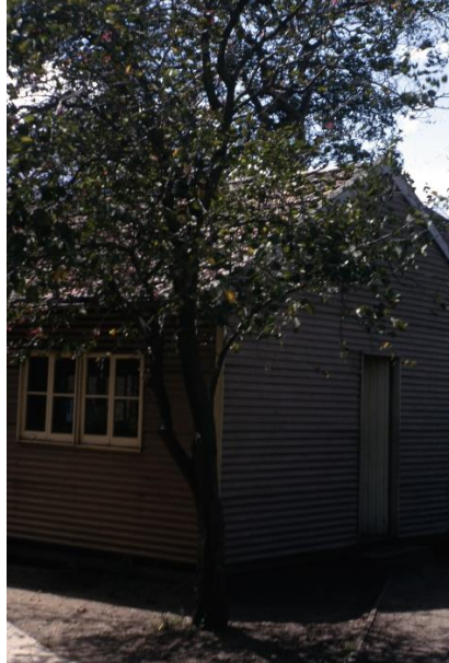
Science Lab, 1965