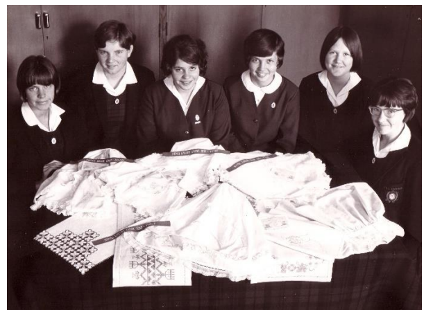
Royal Easter Show, 1967