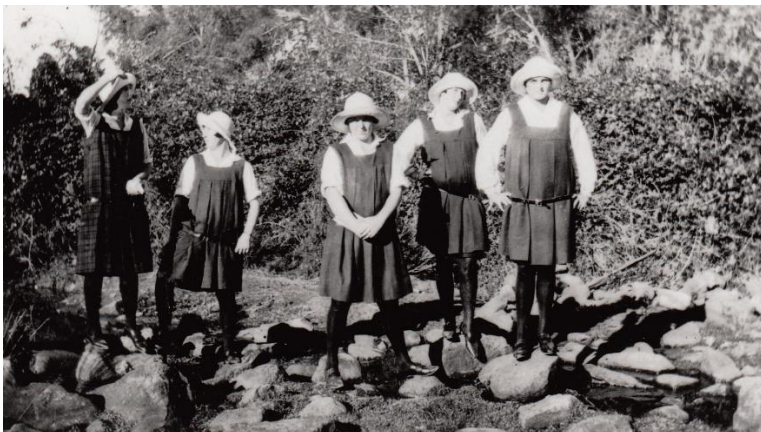
The school camp at Mittagong, 1926