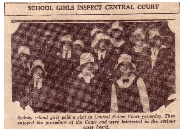
An excursion to the Central Police Court, 1928