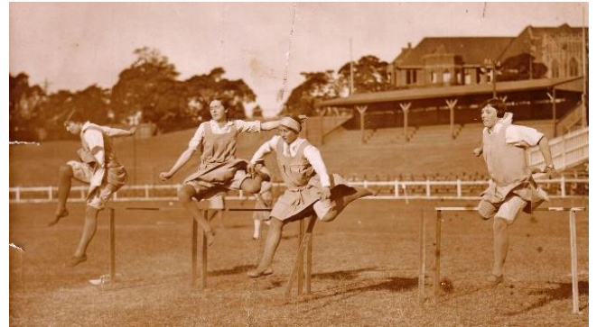
Hurdles at an Athletics Carnival, 1920s