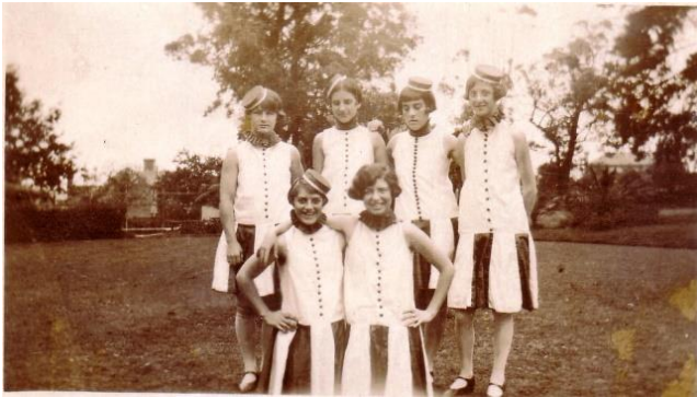
Boards dressed for a "Fun Night" skit, 1925

Other images of PLC Sydney in the 1920s: