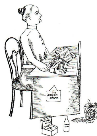
A student drawing from the Aurora Australis , December 1922