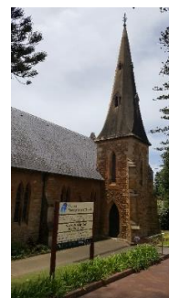
Kiama Presbyterian Church, 2017

Series 1 College Council & Committees Box 455