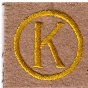
Kinross House Badge, 1936