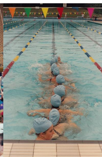
1992 Swimming Carnival