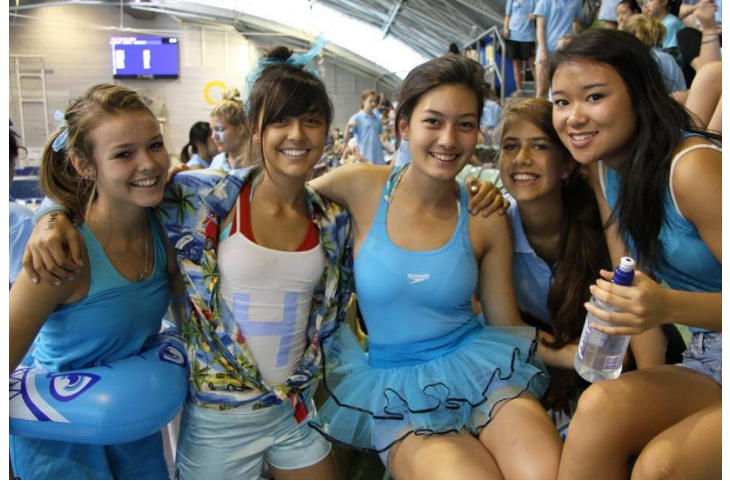
Harper Hippos at the Swimming Carnival, 2010