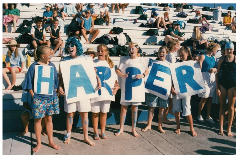
Members of Harper House at the Swimming Carnival, 1989, Ashfield Pool