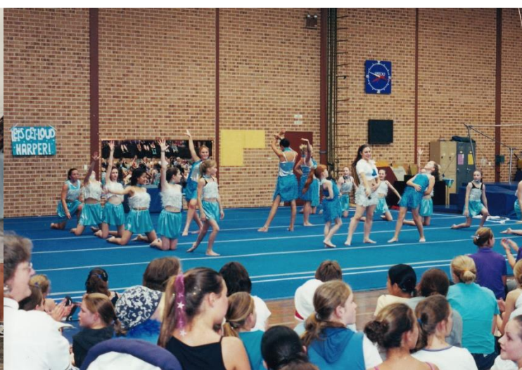
Inter-House Gymnastics, Thompson Hall, 2000