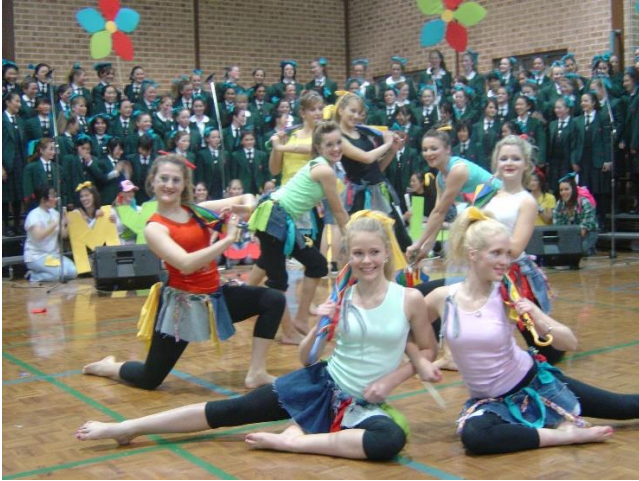
Harper at House Choir Night, 2005

PLC PRESBYTERIAN LADIES' COLLEGE SYDNEY — 1888 —