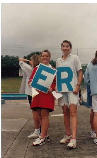
1992 Swimming Carnival