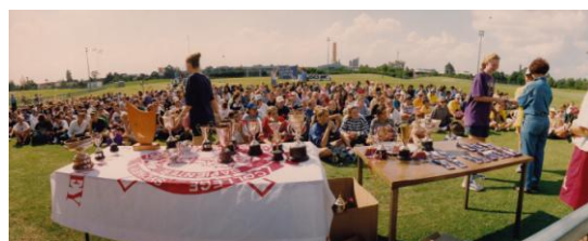
1994 Athletics Carnival, Auburn Athletics Field