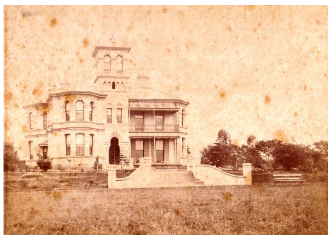
Shubra Hall as it appeared when the College purchased it in 1889.