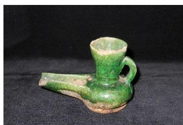
Medieval oil lamp often found in the Fatimid Caliphate 11 th or 12 th century AD