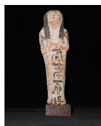
Shabti ceramic funerary figurine New Kingdom 13 th -11 th century BCE