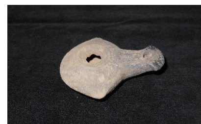
Mould-made ceramic oil lamp (kite-shaped body) probably late second to first century BCE

PLC students and staff can learn more about Dr Marden's Collections by going to “PLC Sydney Archives” in PLACES, Topic 7.