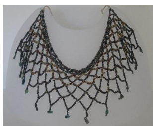
Bead Collar made of blue faience and red and yellow stones, with various faience amulets attached 1 st millennium BCE