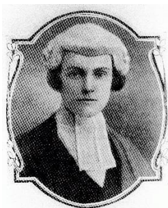
The first female barrister of NSW