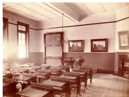
A classroom from the period Sybil Morrison (née Gibbs) was a student