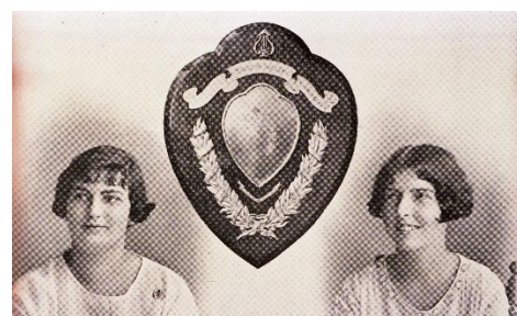
PLC won the Dempster Shield in 1926, the first year of the British Musical Society's Secondary Schools' Eisteddfod. We won it so many times that it became the property of the school.